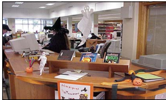
Halloween event at Leesburg Library

During fall convocation week, the Leesburg library hosted the annual meeting of librarians and English faculty. Library staff provided lunch and a review of new library databases.